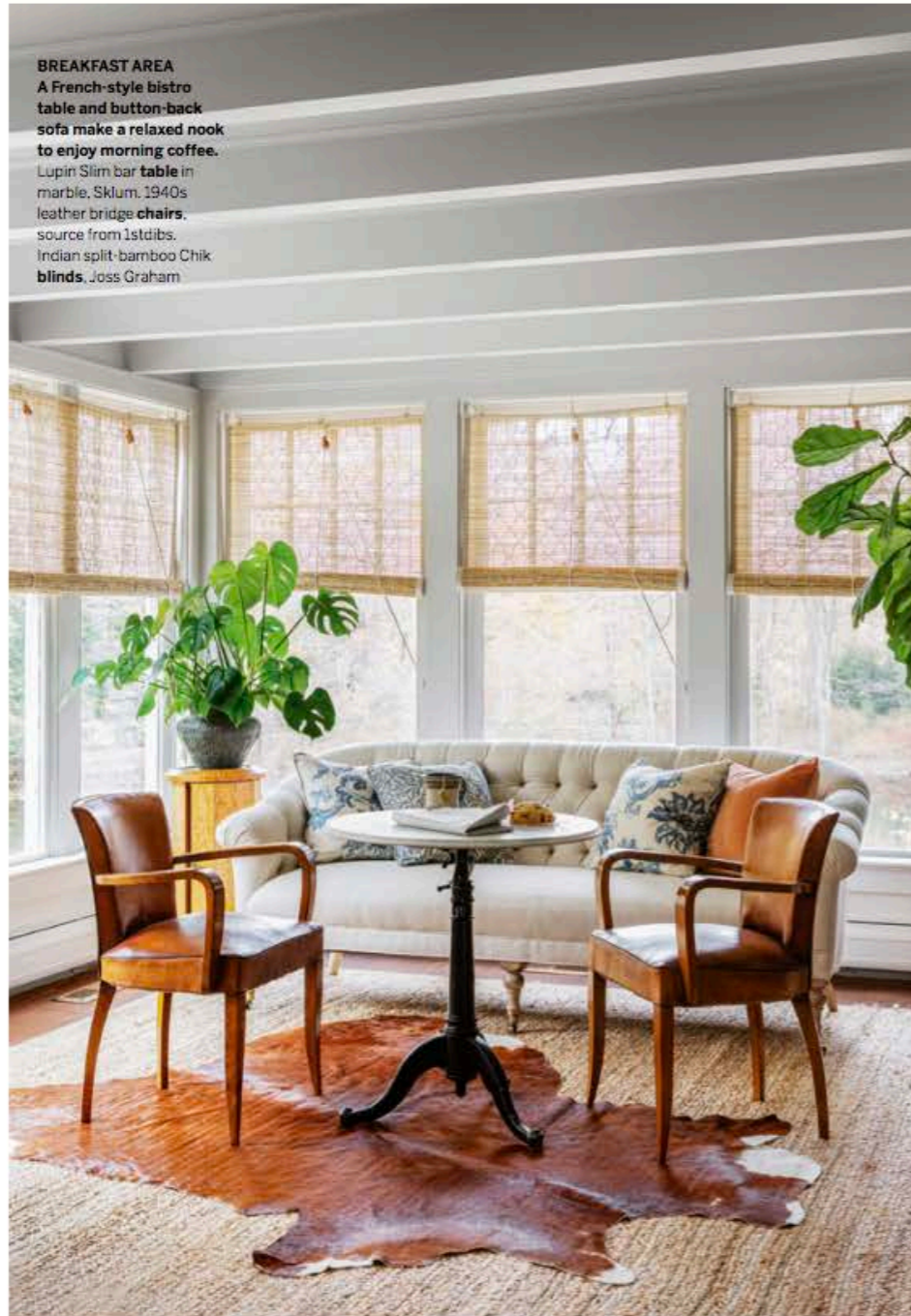
BREAKFAST AREA A French-style bistro table and button-back sofa make a relaxed nook to enjoy morning coffee. Lupin Slim bar table in marble, Sklum, 1940s leather bridge chairs, source from 1stdibs. Indian split-bamboo Chik blinds, Joss Graham