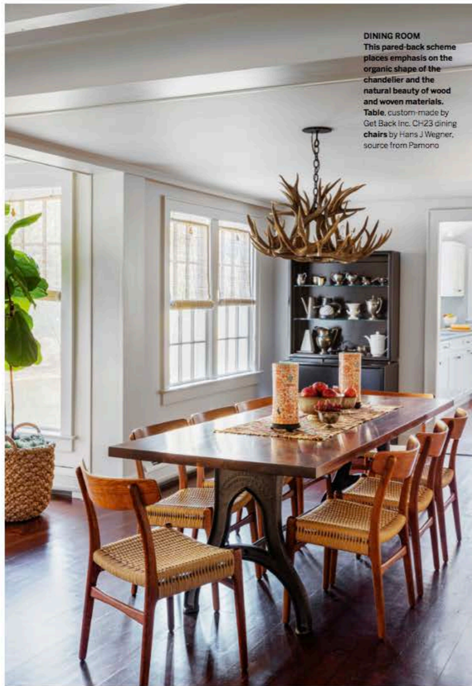
DINING ROOM This pared-back scheme places emphasis on the organic shape of the chandelier and the natural beauty of wood and woven materials. Table, custom-made by Get Back Inc. CH23 dining chairs by Hans J. Wegner, source from Pamono