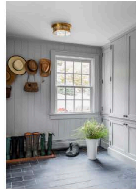
MUDROOM Built-in cabinetry conceals coats and outdoor equipment. Ceiling light, Circa Lighting. Walls in Purbeck Stone, Farrow & Ball