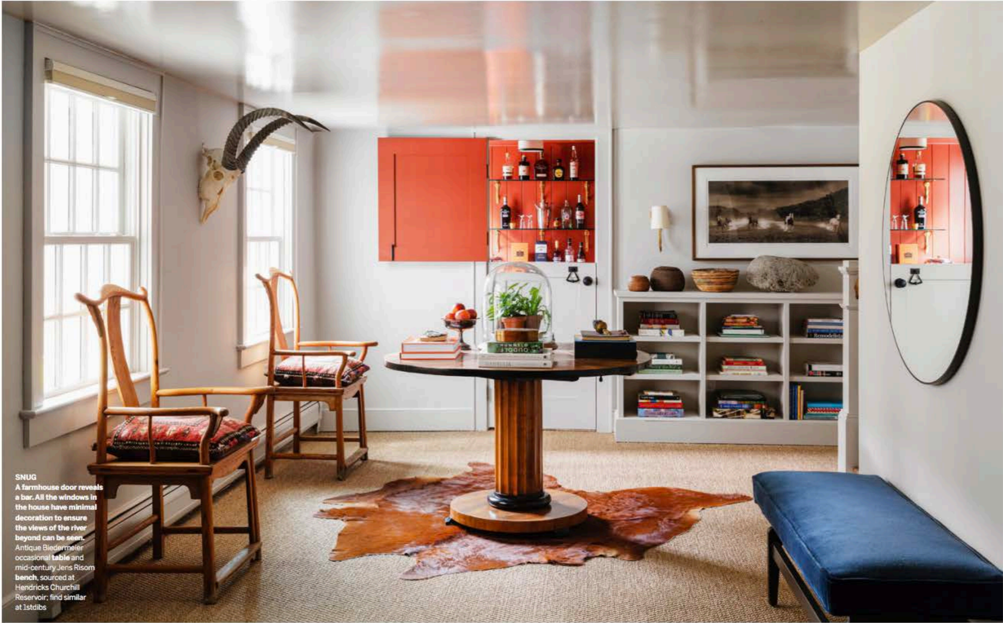
SNUG A farmhouse door reveals a bar. All the windows in the house have minimal decoration to ensure the views of the river beyond can be seen. Antique Biedermeier occasional table and mid-century Jens Risom bench, sourced at Hendricks Churchill Reservoir, find similar at 1stdibs