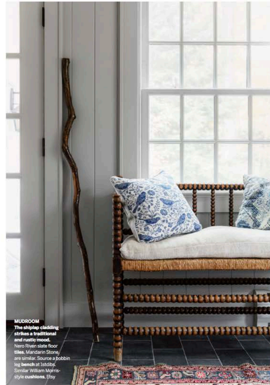
MUDROOM The shiplap cladding strikes a traditional and rustic mood. Nero River slate floor tiles, Mandarin Stone, are similar. Source a bobbin leg bench at 1stdibs. Similar William Morris-style cushions, Etsy