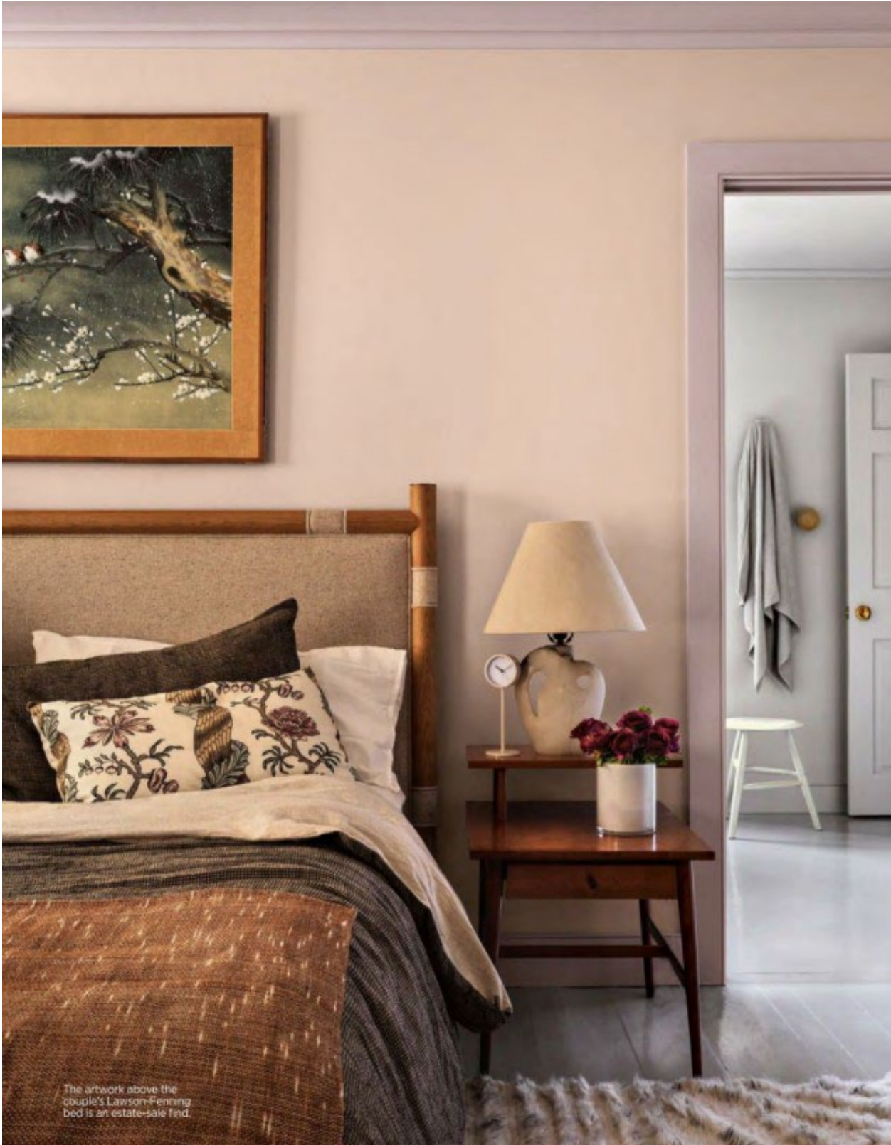
The artwork above the couple's Lawson-Fenning bed is an estate-sale find.