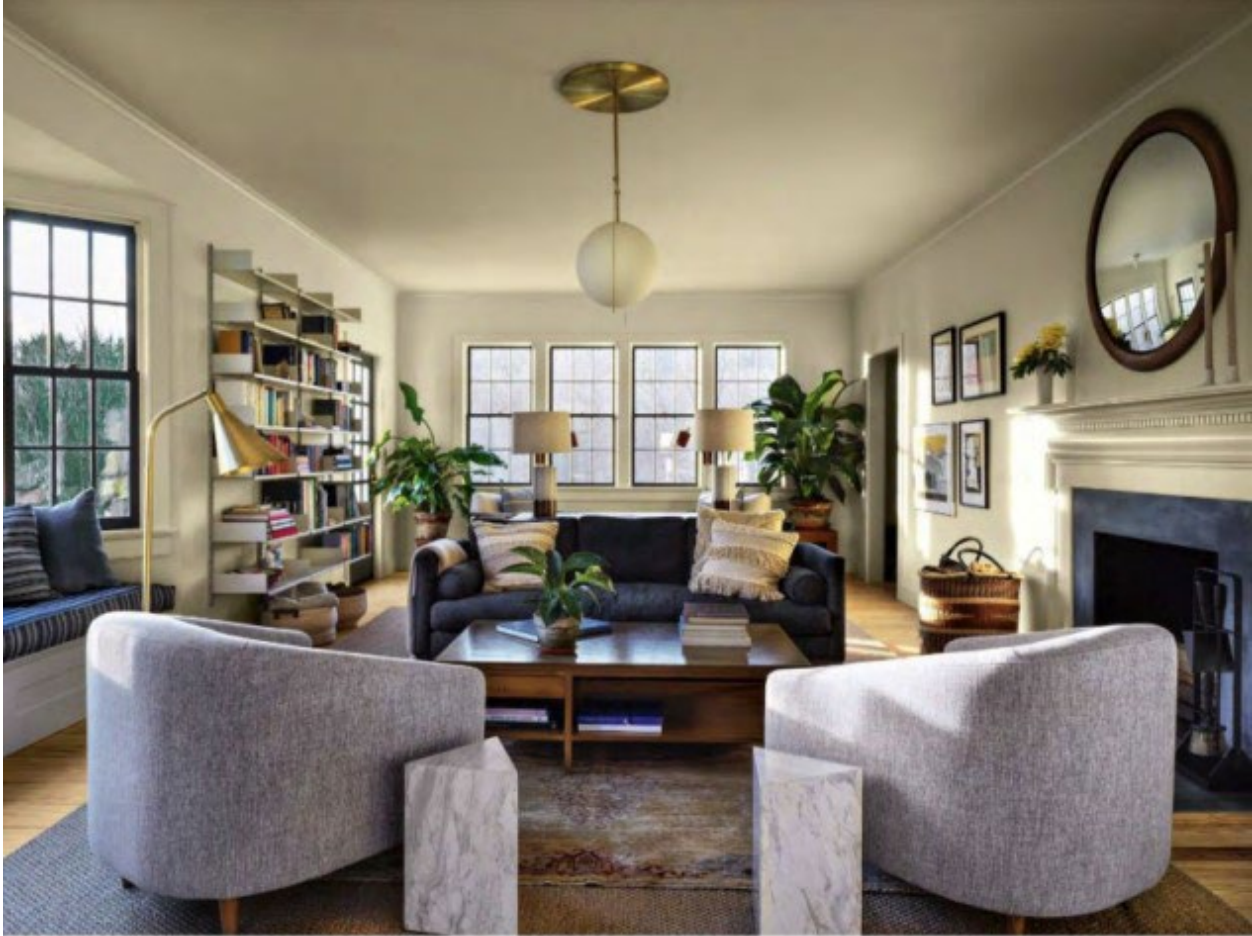
In the living room, CB2 side tables are paired with a vintage Paul McCobb cocktail table from Chairish, a Lawson-Fenning sofa, Stone and Sawyer table lamps, Vitsoe shelves, and a Workstead globe light. Facing page: Above the kitchen's Plain English island are Workstead pendants, on the left is a Bertazzoni range. The paint is by Benjamin Moore.