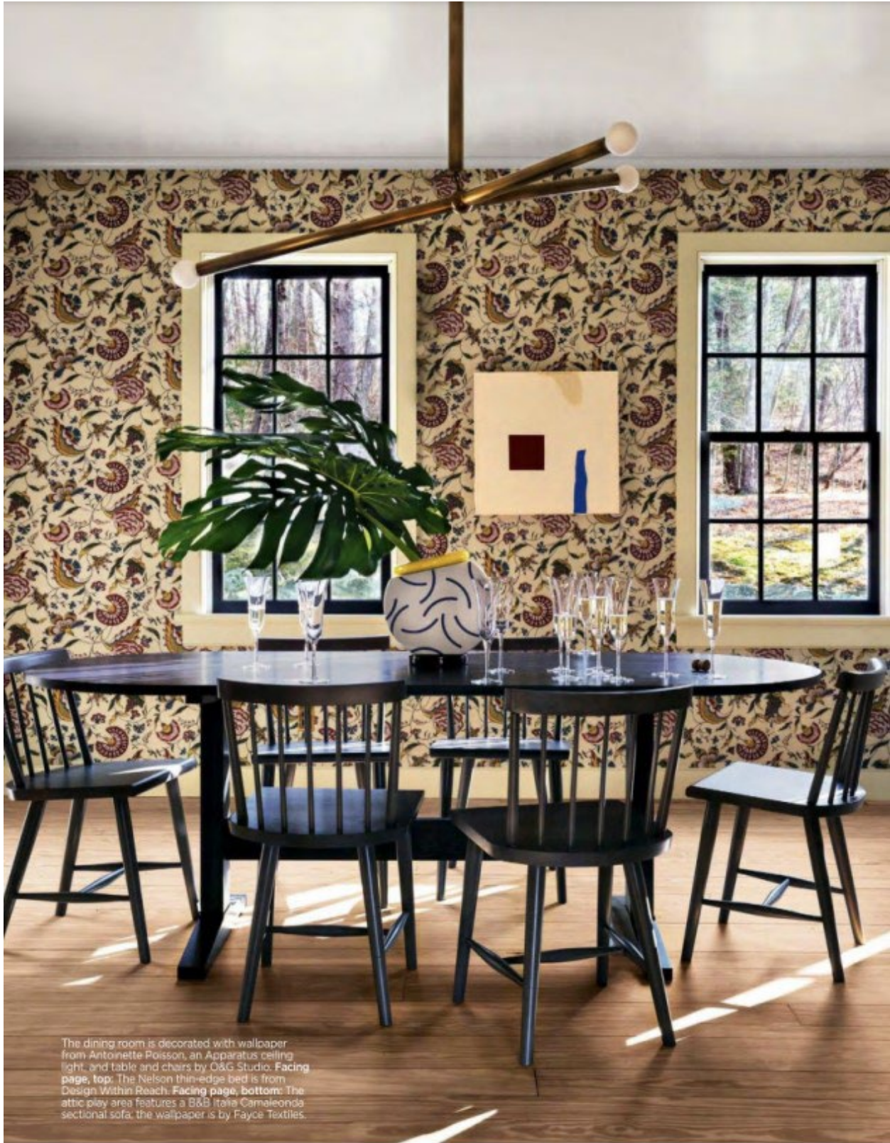
The dining room is decorated with wallpaper from Antoinette Poisson, an Apparatus ceiling light, and table and chairs by O&G Studio. Facing page, top: The Nelson thin-edge bed is from Design Within Reach. Facing page, bottom: The attic play area features a B&B Italia Camaleonda sectional sofa, the wallpaper is by Fayce Textiles.