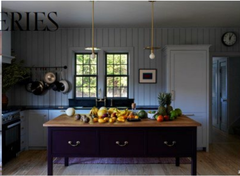
1. ABOVE THE COUPLE'S LAWSON-FENNING BED IS AN ESTATE-SALE FIND. 2. THE KITCHEN'S PLAIN ENGLISH ISLAND, BERTAZZONI RANGE, AND WORKSTEAD PENDANTS; PAINT BY BENJAMIN MOORE. 3. A B&B ITALIA CAMALEONDA SECTIONAL AND FAYCE TEXTILES WALLPAPER IN THE ATTIC PLAY AREA. 4. NELSON THIN EDGE BED FROM DESIGN WITHIN REACH.